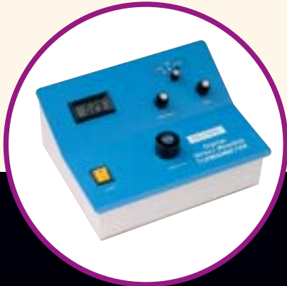
Model 965-10A Bench-top Turbidimeter

Orbeco-Hellige Model 966 Portable and Model 965-10A Bench-top Turbidimeters meet the official specifications of USEPA, ASTM, Standard Methods of APHA, AWWA, WEF and other world recognized authorities. Both are true nephelometers, detecting light from a tungsten filament lamp, at the officially mandated 90° angle between the photo-detector and incident light beam. Direct-reading digital display gives results in NTUs (Nephelometric Turbidity Units) over the full 0-1000 NTU span of turbidity in 3 ranges. Both models meet the design requirements of USEPA Method 180.1 and are ideal for NPDES and NPDWR compliance reporting.