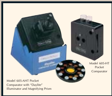
Model 605-AHT Pocket Comparator with "Daylite" Illuminator and Magnifying Prism