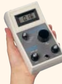
Model 966 Portable Turbidimeter

Portable Model 966 and Bench-top Model 965-10A Turbidimeters quickly and precisely measure the clarity or cloudiness of any type of fluid. Both meet the official specifications of USEPA, ASTM, Standard Methods of APHA, AWWA, WEF and other world-recognized authorities. True nephelometers, both test at the officially mandated 90° angle between photo-detector and incident light beam. Both Models are equipped with a tungsten filament lamp. Direct-reading displays give results in NTU's (Nephelometric Turbidity Units) over the full span of turbidity in 3 ranges. Both meet design requirements of USEPA Method 180.1 and are ideal for NPDES and NPDWR compliance reporting. Also can be used to test water for Barium, Sulfate, Nitrate, Silver and Chloride using turbidimetric chemical analysis.