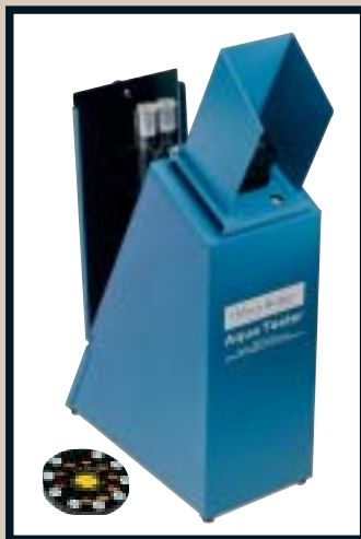
Model 611-A Aqua Tester with Magnifying Prism