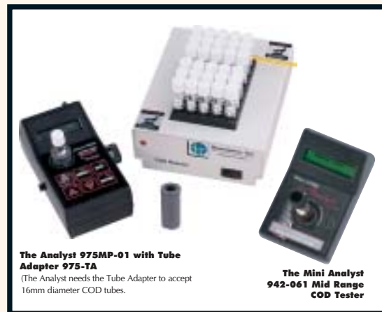
The Analyst 975MP-01 with Tube Adapter 975-TA

The Chemical Oxygen Demand (COD) test is widely used as a measure of organic contamination by determining the quantity of oxygen required for oxidation of reduced species including organic matter, in a water sample using a specific oxidizing agent, temperature and time reduction. COD testing is more reliable and is preferred to BOD testing as test results are more reproducible and are ready in two hours (or less) rather than 5 days. In addition, COD testing is a better indicator of organic pollutants in industrial wastewater containing cyanides and heavy metals. COD testing affords rapid response to changing conditions before critical problems develop.