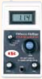
Portable Model 966-IR

New model 966-IR Portable and 965-IR Bench-top Turbidimeters fully meet worldwide ISO 7027 requirements. Using a long life IR (infrared) LED (860nm wavelength), Orbeco-Hellige IR turbidimeters accurately measure turbidity from 0-1000 FNU/NTU over 3 ranges. Readings are unaffected by color thereby making Orbeco IR turbidimeters ideal when testing the turbidity of all liquids, whether clear or colored.