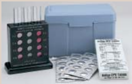
Model 608-01A Chlorine, Free & Total and Carrying Case

Low in Cost...High in Quality. When low cost testing is most important, compact & inexpensive Simplex test kits permit anyone to make accurate on-site tests for Chlorine (DPD or Ortho-tolidine) and pH easily and quickly. Every Simplex test kit uses eight (8) built-in, guaranteed non-fading, color standards mounted in a durable, corrosion-resistant housing. All standards can be seen at a glance and compared directly to the color of the test sample. No color discs or slides needed. Readings are simple and foolproof. Each Simplex test kit comes complete with comparator, carrying case, reagents and instructions. No other test kits are easier to operate...or lower in price!