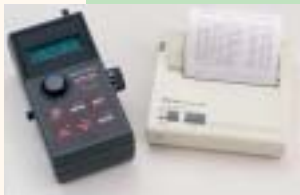
Model 975 MP-10 and Model B-PR-03 Portable Serial Printer showing Orbeco's Data Base printout

Orbeco's Exclusive Data Base Printout - the most complete listing of test result information available.