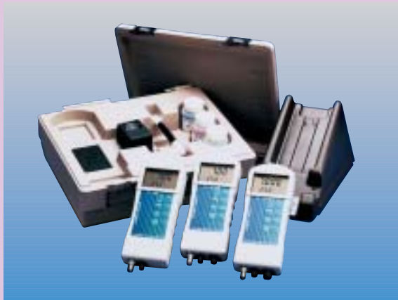
Models B-266, B-267, B-269 pH Meters, Carrying Case & PowerMate™ Rechargeable Base

Low priced, quality pH meters with features found only in expensive bench-top models. Auto buffer recognition. Auto Temperature Compensation (ATC) for buffers and samples. Auto end-point sensing. Advanced software provides for data acquisition, computer and printer interface. Optional PowerMate™ rechargeable base is available for all models.