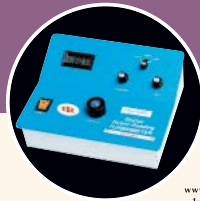
Bench-top Model 965-IR